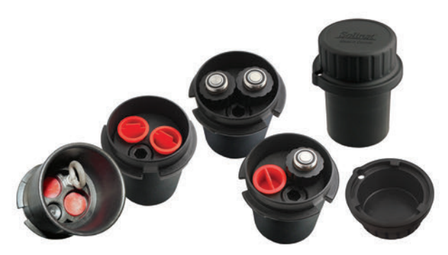
Levelogger 2" Locking Well Cap Installations (see Well Caps data sheet for more details)

The cap is vented to equalize atmospheric pressure in the well. It slips over the casing, and the cap can be secured using a lock with a 3/8" (9.5 mm) shackle diameter.