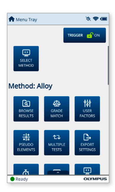
The Vanta analyzer's modern interface is easy to use and navigate.