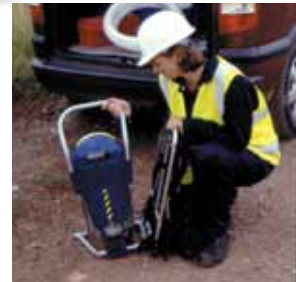
PowerPack PP1 back-pack frame.