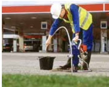
PowerPack PP1 over flush-fitting borehole.

The PowerPack PP1 is an ergonomically designed, compact, power actuator for use with Waterra inertial pumps.