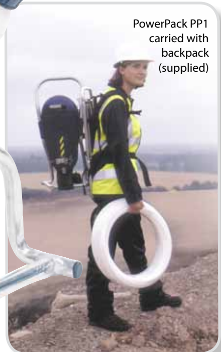
PowerPack PP1 carried with backpack (supplied)