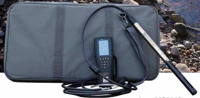
Item #696162 Soft-Sided Carrying Case

For more info visit: YSI.com/ProSwap-Logger