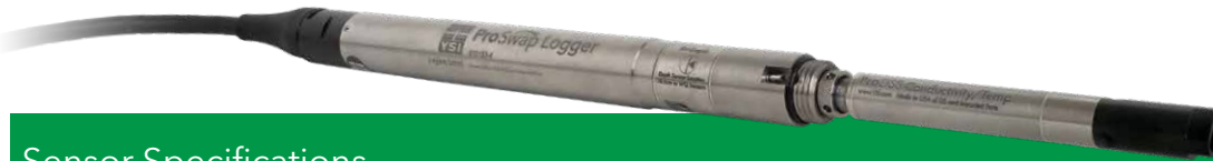
ProSwap Logger with Conductivity/ Temperature Sensor combination

ProSwap Logger is compatible with any individual ProDSS Digital Smart Sensor for fast, easy setup and high quality data. Each sensor features a welded titanium body, auto-recognition, and local storage of calibration for quick swapping. Trusted by water monitoring professionals, these sensors provide accurate data with advanced technology and proven performance!