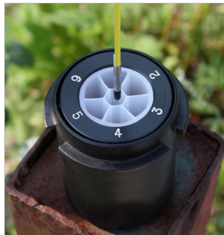
Measure water levels within the narrow channels of a Solinst CMT® System.

The 102M Mini Water Level Meter is available in 25 m and 80 ft lengths. There is the choice of the P4 or P10 Probe.