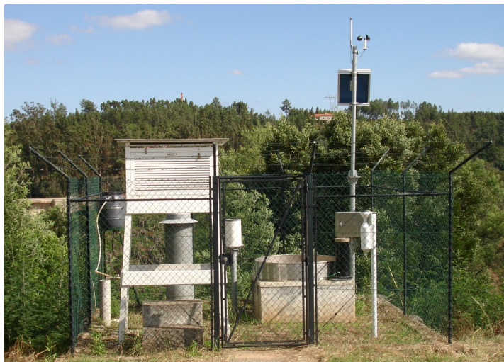
OMC-045-III in a meteorological measurement station