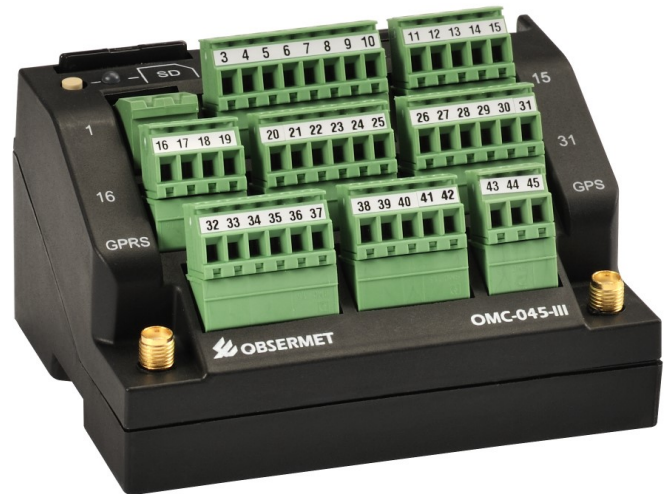
The OMC-045-III data logger

Data transfer is done in a simple ASCII file format. The file format is open. Models delivered before Q4/2016 do not support UMTS (or 3G).