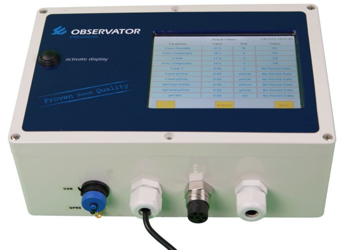
The OMC-045-III with housing and touch screen display