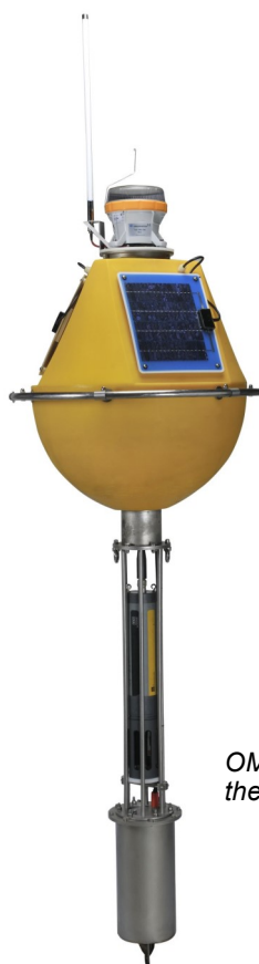
OMC-045 installed in the hull of the OMC-7006 data buoy