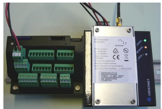
The OMC-045-III with Iridium modem