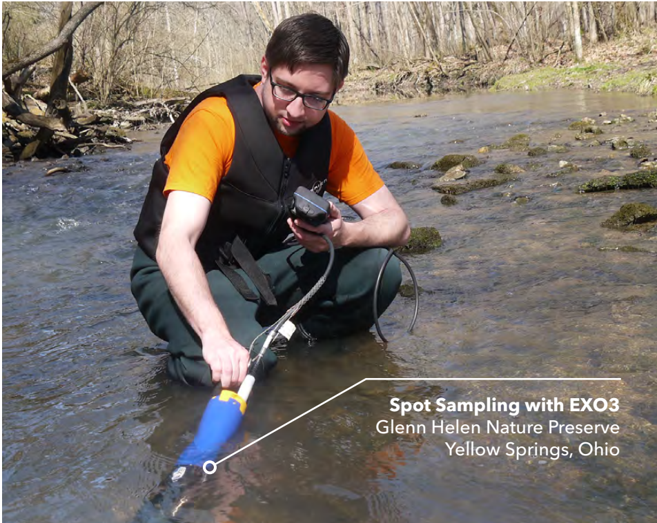
Spot Sampling with EXO3 Glenn Helen Nature Preserve Yellow Springs, Ohio