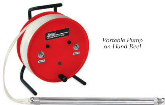
Portable Pump on Hand Reel

For less frequent sampling, reel mounted portable systems allow access to multiple monitoring wells, even in remote locations. The reel mounted portable units are free-standing with a convenient carrying handle. They can be made for almost any size or depth of application.