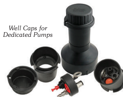
Well Caps for Dedicated Pumps

Pneumatic drive pumps are well suited for pumping contaminant liquids. High solids content, solvents, hydrocarbons, and other chemicals are easily and economically pumped.