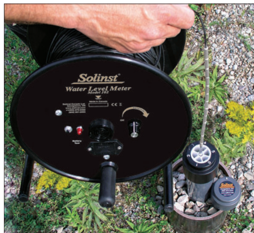
Measure Water Levels within the narrow channels of a Solinst CMT® System.

The 102M Mini Water Level Meter is available in 80 ft. and 25 m lengths. There is the choice of the P1 or P2 Probe with segmented weights.