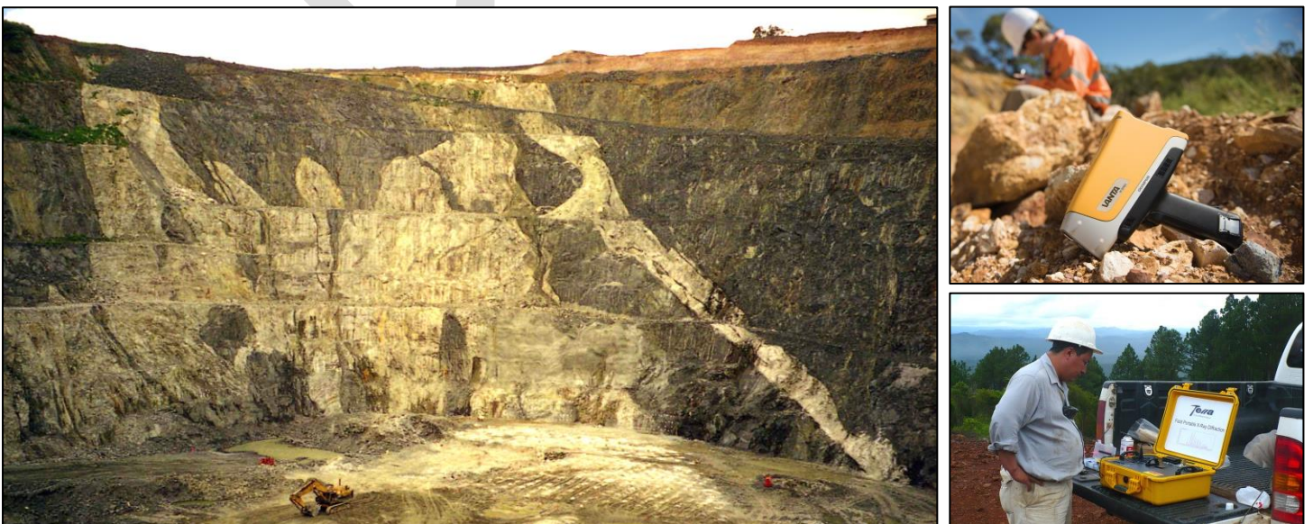
Figure 1. (above) The World-Class Greenbushes Li-Ta-Sn LCT Pegmatite in Western Australia, (top-right) An Olympus VANTA Portable XRF Analyser used for geochemical mineral exploration (lower-right) Olympus Terra Portable XRD for mineralogy

Work completed by Trueman & Cerny (1982) describes