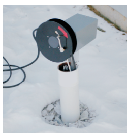
Auto Seeker Reel