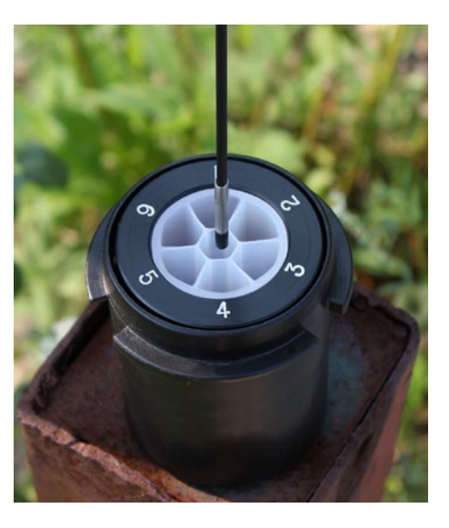
Measure Water Levels within the narrow channels of a Solinst CMT® System.

The 102M Mini Water Level Meter is available in 80 ft. and 25 m lengths. There is the choice of the P4 or P10 Probe.