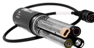
Single cable design with depth option (4 port cable)