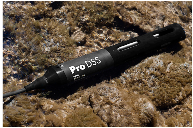
ProDSS 4 port cable assembly

"The meter, cable and sensors are sturdy, well protected for field work, well designed, and professional." - ProDSS User