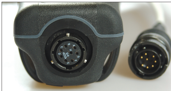
The YSI MS (military spec), waterproof, bayonet-style keyed connectors are far superior to plastic connectors.