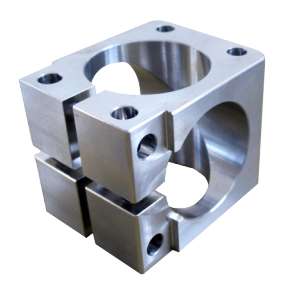
Mounting cube: vertical / horizontal variable fixation

The SQ can be used for various different applications due to its compact design, its housing, which is water-proof and resistant against aggressive liquids, and its convenient and simple installation solutions. Open channels, semi-filled pipes, shafts, ducts and other technical bodies of water are possible applications for the measurement of process, waste and industrial water with the SQ.