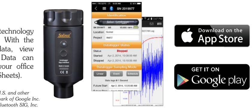
High Quality Groundwater and Surface Water Monitoring Instrumentation

A firmware upgrade will be available from time to time to allow upgrading of the AquaVent, as new features are added.