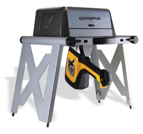
DELTA Portable Workstation with integrated safety-lock shielding for powdered or small objects; a PC is connected for remote control of this closed-beam DELTA set-up.

OLYMPUS NDT INC. is ISO 9001 and 14001 certified